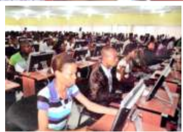
Students writing their exams with computer