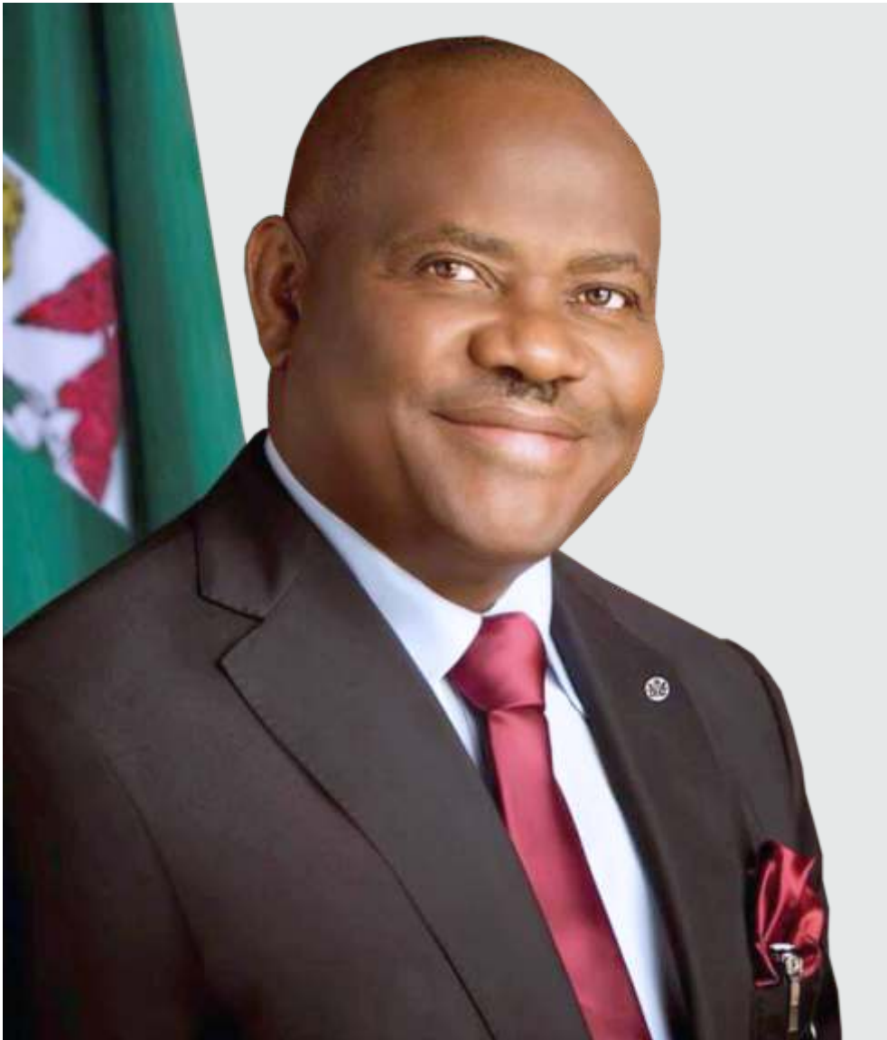
His Excellency BARR. NYESOM EZENWO WIKE, CON Executive Governor, Rivers State and Visitor of the University