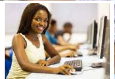
A student handling online registration by herself